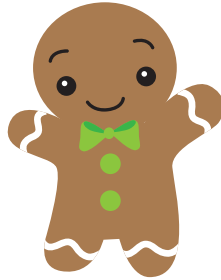
A cookie sheet

What did the gingerbread man find on his bed?