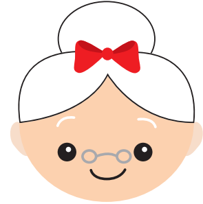
Looks like rain, dear (reindeer)

What did Mrs. Claus say when she looked up in the sky?