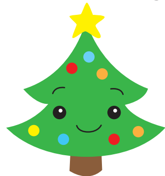
They always drop their needles