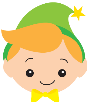
He wanted to sleep like a log

Why did the elf put his bed into the fireplace?