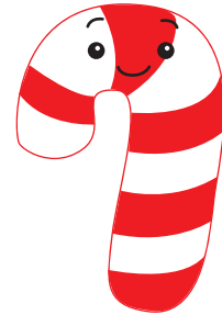
A sad candy cane

What's red, white and blue at Christmas time?